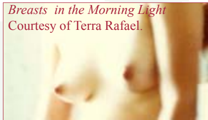
Breasts in the Morning Light